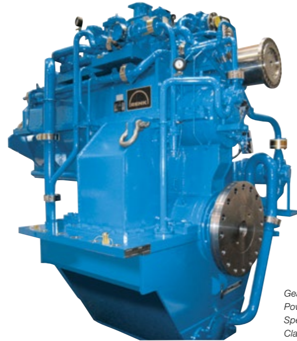
Gear unit type: RSVL-950 Power: 7,200 kW Speed: 500/145.6 rpm Classification: BV

In addition to complying with the chosen classification society requirements, the gear units are engineered to RENK's in-house safety standards which are often even stricter.