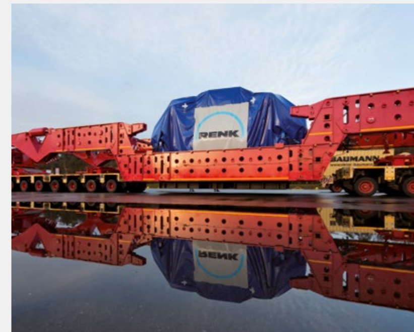
RENK's access to inland waterways and fast connections to major roads provide ideal logistic facilities.