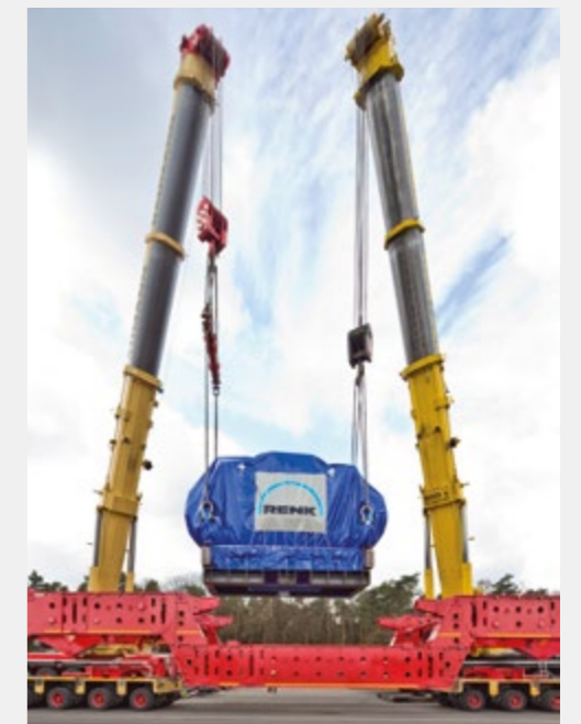
Logistics: 280 ton CDSHII-4800 by waterway and road from Rheine (G) via Rotterdam (NL) to Pula (HR).