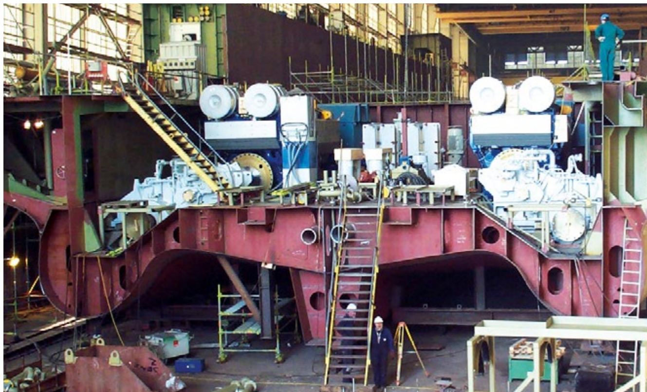
The gear units installed in the hull of the dredger.