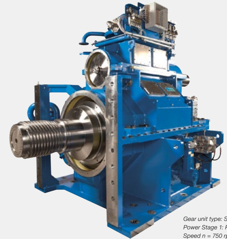
Gear unit type: SVG-2S-1000 Power Stage 1: P = 8,000 kW Speed n = 750 rpm/253.1 rpm Power Stage 2: P = 3,200 kW Speed: n = 750 rpm/193.4 rpm

A characteristic feature of RENK's dredge pump gearboxes is the flexible housing and gear-set designs for horizontal, vertical and diagonal shafts. Single and double input configurations offer optimal flexibility.