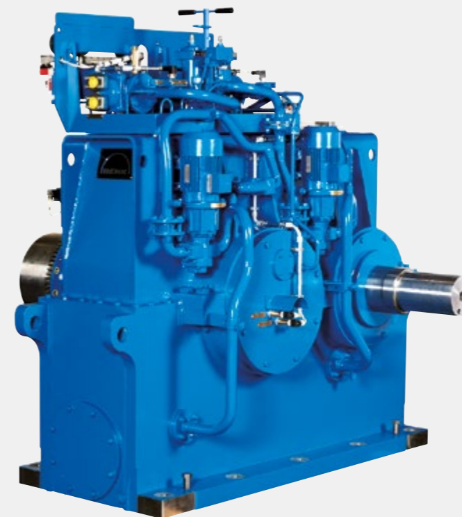
Gear unit type: SH-710 Power: P = 3,800 kW el. motor Speed: n = 1,200 – 1,500 rpm; 280 – 350 rpm