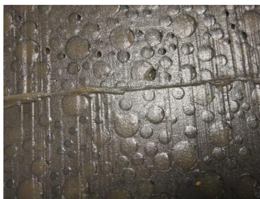
Ecofix ® applied – additional application counter direction is required in order to fill all pitting